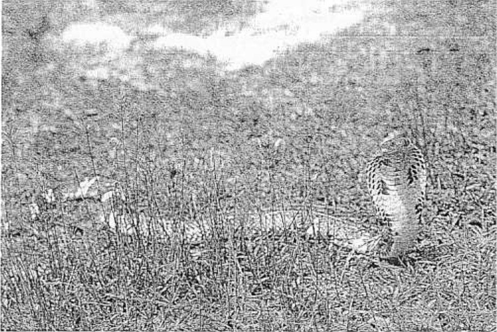
Figure 1. Frontal view of Indo-Chinese Spitting Cobra Naja siamensis photographed captive in a village near Dong Phou Vieng National Biodiversity Conservation Area, Savannakhet Province, central Laos.